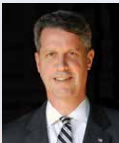
ACCG Executive Director

Administrative Assistant Office: 404.522.5022 nlogan@accg.org