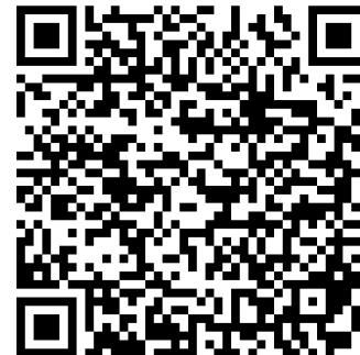
Candidate Registration Guide